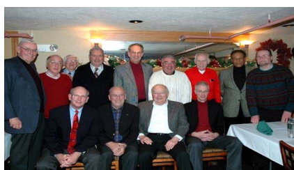
Bowlers on the Club's Two Teams