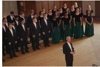
Here are few views of the Huron High A Capella Choir