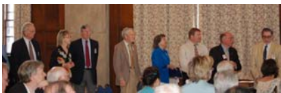
Our newest Paul Harris Fellows

We'll vote at the next meeting on a bylaw concerning internal financial control policy