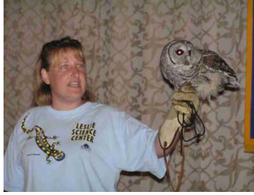
A Leslie Staffer and a barred owl

So on July 1, the Leslie Science and Nature Center comes into being as a nonprofit agency, in partnership with the City of Ann Arbor and the National Wildlife Federation. NLF spokesman