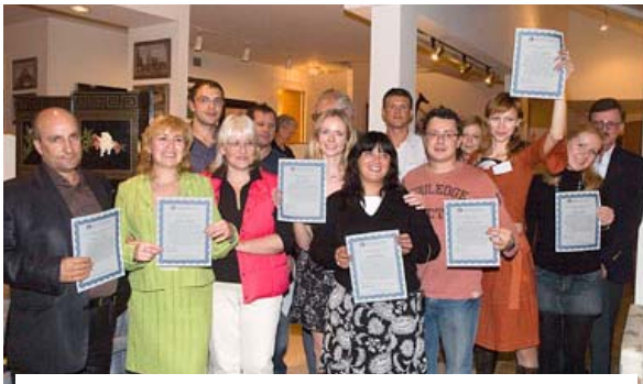
Members of the PEP and their “Diplomas”