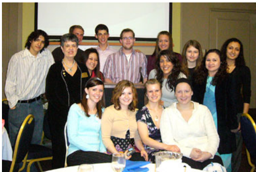
DG Audrey with U-M Rotaractors

Rotaract Filipino Night on March 30: Here are two photos from the event put on by the U-M Rotaract Club.