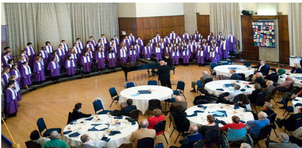
The magnificent Choir