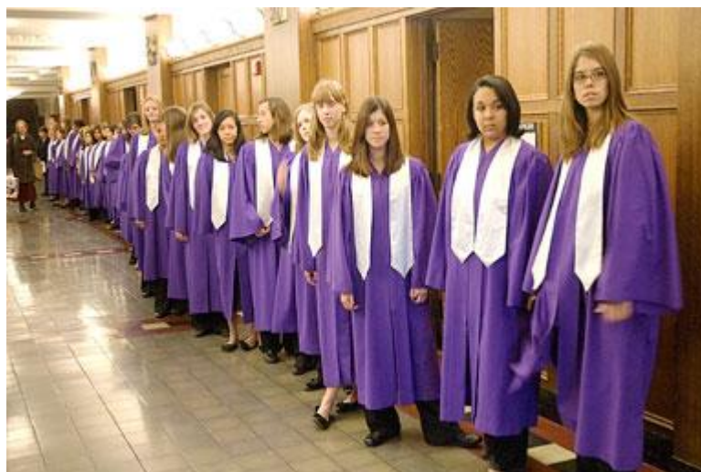
Lined up for the entrance