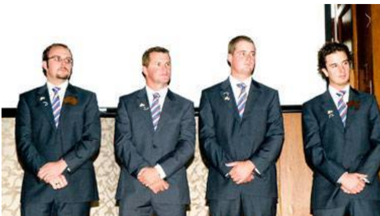
And, lest we forget out Australian friends, here's a reminder of a wonderful visit. From left to right: