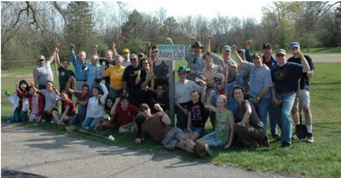
Who Doesn't Love A Tree??!